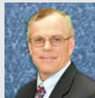
Forbes & Merricourt