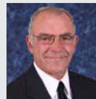
Crete & Milnor