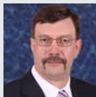
Nelvik & Ventura