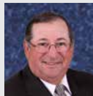
Dickey, Litchville & Marion