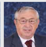
Fullerton & Guelph