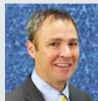
Ellendale, Ashley, Kulm, Edgeley & LaMoure